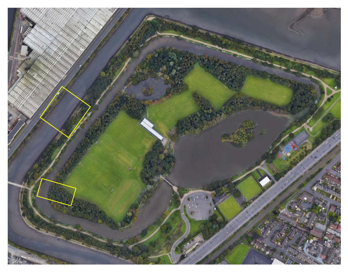
Figure 1. Victoria Park with outlined areas marking location of rook nests in 2024 (lower box outlining the new nesting area), and demarcation for nest removal prior to 2025 breeding season.

P1. Rook nests along southern periphery of Victoria Park in 2024 and coincident with Birch besom ( Taphrina betulina )